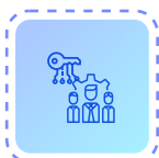
Authority Management & Workflows