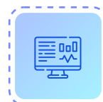
Analytics & Reporting