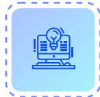
User & Channel Partner Experience