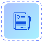
Policy Life Cycle